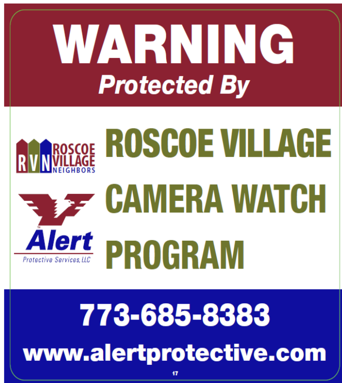
A sample sign noting the new security program to appear on Roscoe Street. RVN plans to start working with local business to begin the process of camera installation this spring.