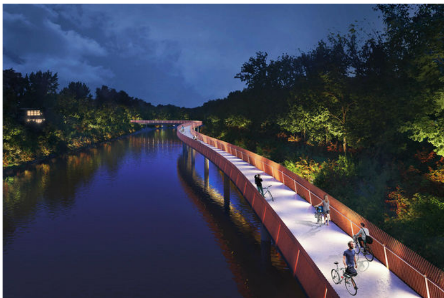
Rendering of the Riverview Bridge of 312 RiverRun.

This fall, the City of Chicago broke ground on a bridge and pedestrian walkway that may change the way Roscoe Villagers view and use the Chicago River. Dubbed "312 RiverRun," the project is poised to connect parks along the riverfront from Horner Park to our own Clark Park. As a first step, the City is building the Riverview Bridge, which will rise 18 feet above the river and stretch for over 1,000 feet between Belmont Avenue and Addison Street. Once the bridge is complete—which planners claim will be by the end of 2018—cyclists and runners who enjoy traversing Clark Park will have a new, scenic option for recreation. Future phases of 312 RiverRun will extend pedestrian access along the river linking California and Horner parks.