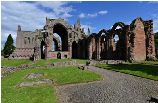
Scotland's Melrose Abbey, namesake of Melrose St.